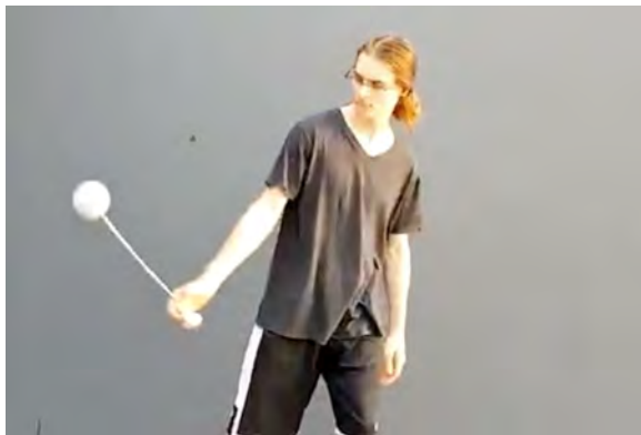
Figure 1: The conventional way of playing a sonic poi.

HappyBrackets is an open source Java based programming environment for creative coding of multimedia systems using Internet of Things (IoT) technologies [1]. Although HappyBrackets has focused primarily on audio digital signal processing—including synthesis, sampling, granular sample playback, and a suite of basic effects—we created a virtual spacecraft game that added the functionality of controlling a planetarium display through the use of WiFi enabled Raspberry Pis. The player manoeuvres the spacecraft by manipulating a sonic poi 1 , which is usually played in the manner shown in Figure 1. The poi contains an inertial measurement unit (IMU), consisting of an accelerometer and gyroscope; and a single button. The goal of the