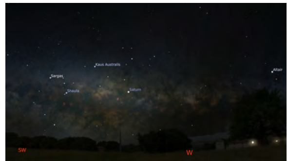
Figure 2: Saturn viewed from the ground from Stellarium.

the field of view. For example, Figure 2 shows how the player might view Saturn from Earth, while Figure 3 shows how the player may view Saturn from their spacecraft. The sonic poi generates sound that is indicative of the player's field of view. Additionally, the poi provides audible feedback when the player zooms in or out.