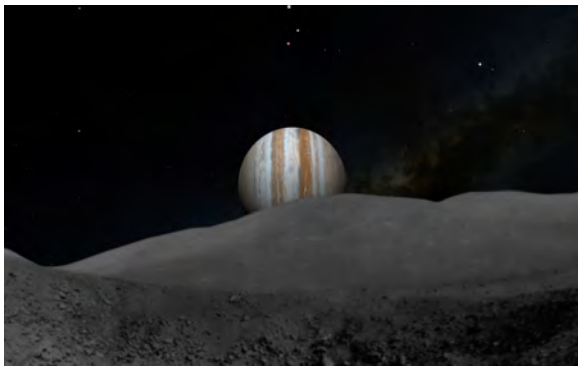
Figure 4: A simulation of Jupiter viewed from Io.

Stellarium is an open source software project distributed under the GNU General Public Licence with the source code available through Git Hub 10 . Stellarium functions as a virtual planetarium; calculating positions of the Sun, moon, stars and planets based on the time and location defined by the user. Moreover, the viewing location does not even need to be on Earth. For example, Figure 4 displays Stellarium rendering Jupiter viewed from its moon Io.