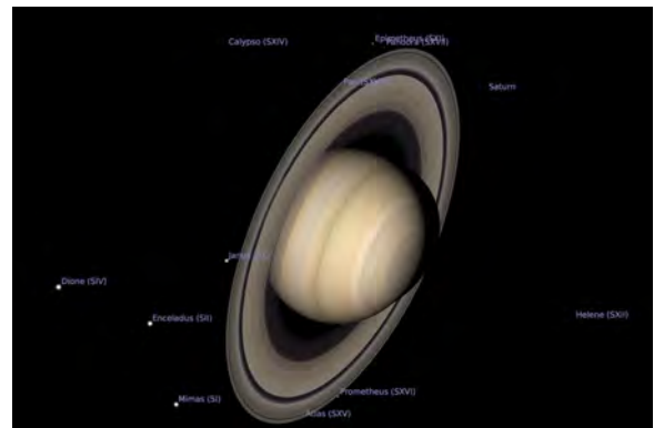
Figure 3: A closer view of Saturn from Stellarium.

The University of New South Wales required a display for their open day to showcase some of the work conducted in the Interactive Media Lab. The opportunity to develop an environment whereby visitors could engage with the technology we were developing would not only facilitate attracting possible future students, it was also a way to develop and test the integration of various research components we were conducting. Many managers and business seek to engage new customers through gamification [3]—in this case, prospective customers were potential students. Furthermore, research indicates that visualisation and interpretation of software behaviour de-