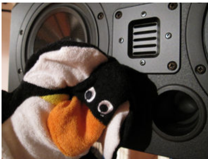
Figure 1: Ping.

All figures should be centered on the column (or page, if the figure spans both columns). Figure captions (in italic) should follow each figure and have the format given in Figure 1. Vectorial figures are preferred (e.g., Postscript, PDF, etc.). Also, in order to provide a better readability, figure text font size should be at least identical to footnote font size. If bitmap figures are used, please make sure that the resolution is enough for print quality. Figure 2 illustrates an example of a figure spanning two columns.